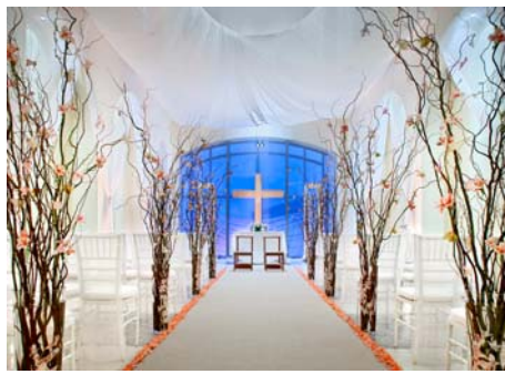
Indoor Catholic Chapel