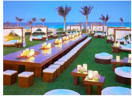
Sea Side Garden